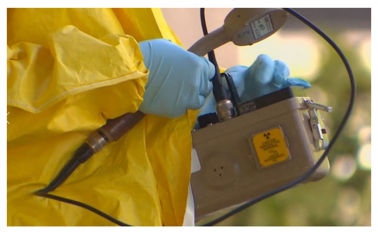
The cleanup effort at the research facility in Seattle has been lengthy, painstaking and expensive.

No date has been set for when the building might be restored to its previous uses.