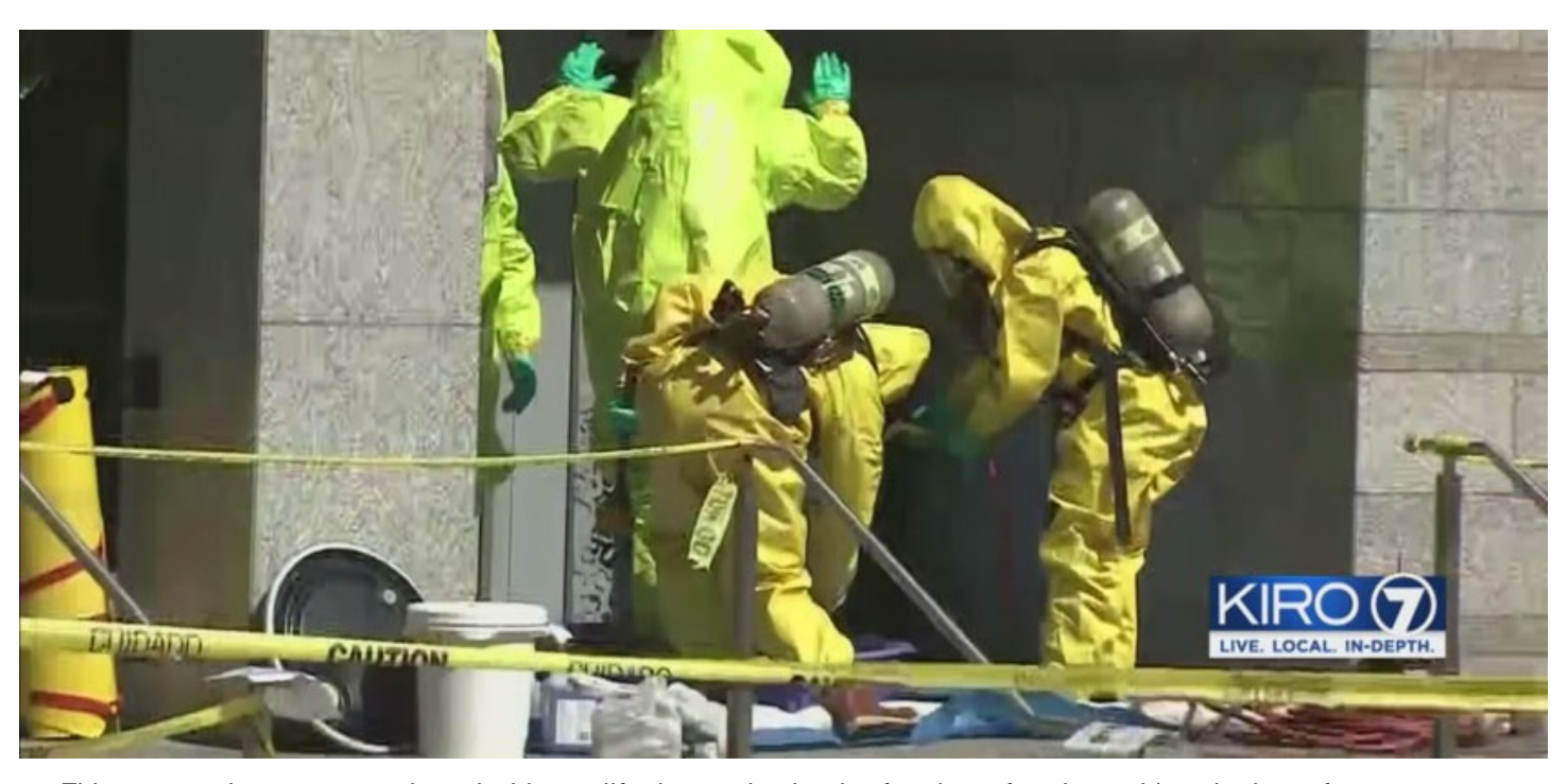
Thirteen people were contaminated with non-life-threatening levels of cesium after the accidental release from an irradiator in Seattle on May 2.

Thirteen people were contaminated with non-life-threatening levels of cesium: eight technicians who'd been trying to remove the irradiator, a building custodian and a radiation safety officer assigned to oversee the removal, two inspectors with the state health department and an FBI agent who wound up with cesium in his hair.